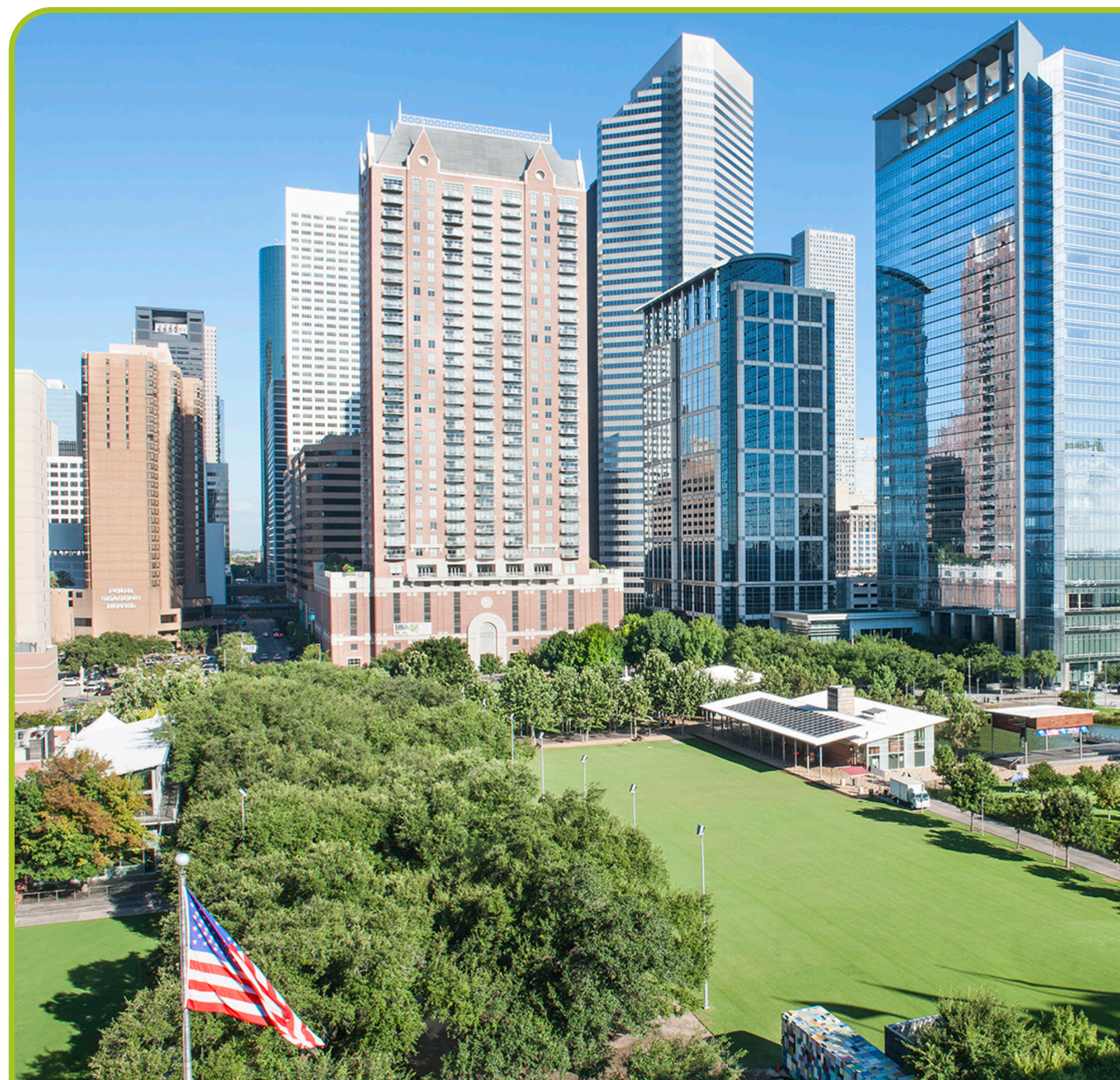
Discovery Green, Houston, TX