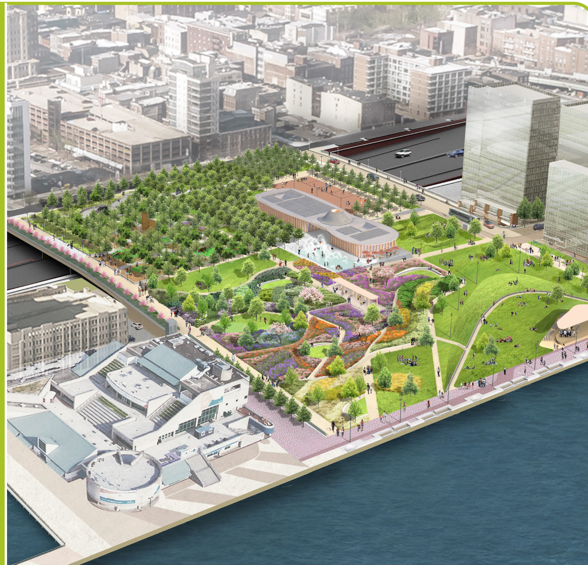
Penn's Landing Park , Philadelphia, PA