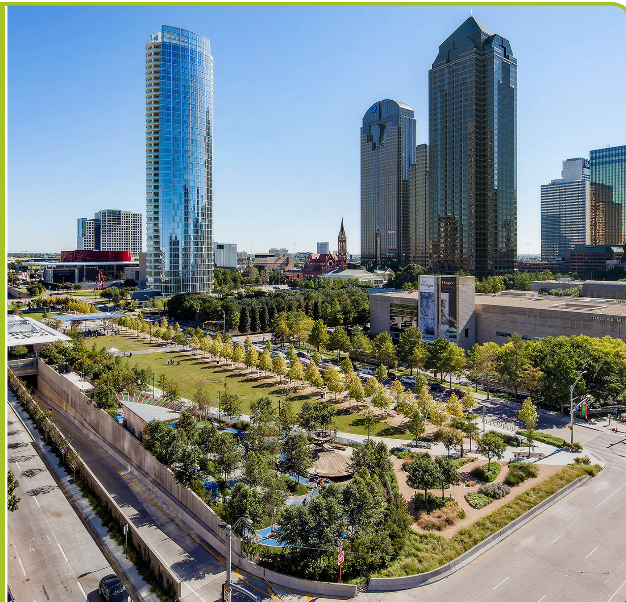
Klyde Warren Park, Dallas, TX