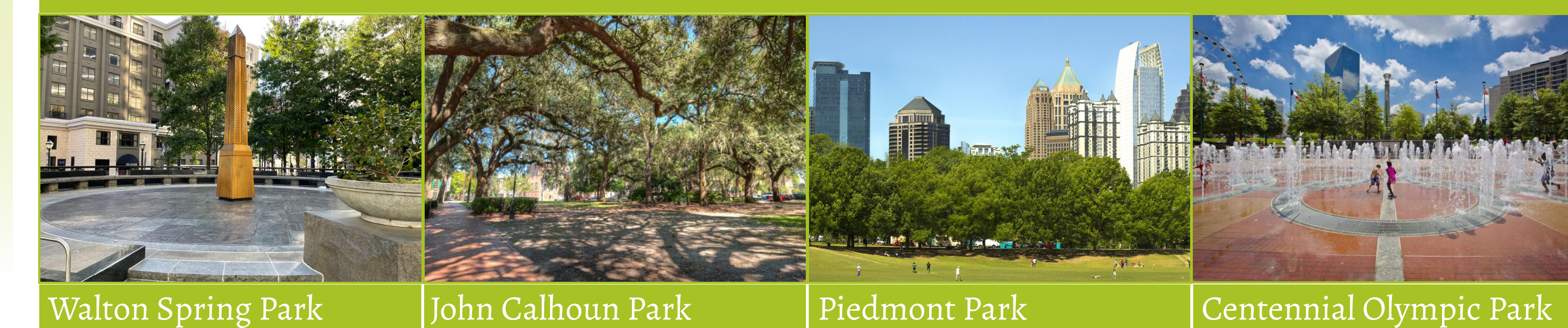
Walton Spring Park